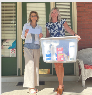
NORTHUMBERLAND FOOD DONATIONS

AS THE LEAVES BEGIN TO CHANGE across our region, our teams have been out and about in their communities, while gearing up for our integration with C&N.