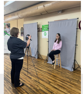
SCB'S C&N ORIENTATION IN WELLSBORO