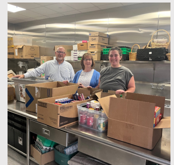
UNION SNYDER FOOD HUB DONATION DRIVE

Our Mifflinburg and Lewisburg offices packed food boxes for distribution to those in need with the Union Snyder Food Hub. Thank you to everyone who contributed to helping fight hunger in our community!