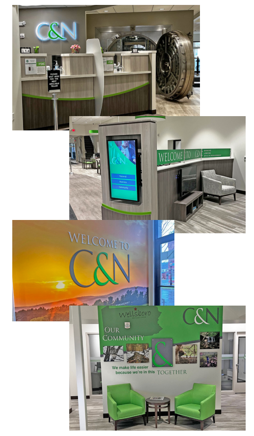
C&N's Wellsboro office remodel was completed in March of 2022.

In our SouthCentral region, our York office has transitioned from a Loan Production Office to a full-service branch and a new, full-service office in Lancaster is now open for business. In our SouthEast region, the wheels are in motion to relocate the Paoli offices to a more visible and accessible location in Chesterbrook. These strategic moves will position us for long-term growth and continued expansion in these important markets.