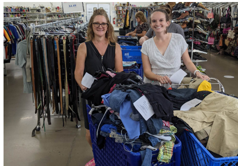
Two Wellsboro area teammates purchasing "back to school" clothes for area children.

Underprivileged children are another demographic that was greatly impacted by the COVID-19 pandemic. The closing of schools