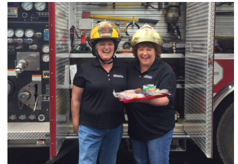
Two of our East Smithfield team members volunteering for the Smithfield Township Fire Department.

In June 2021, C&N teams partnered with 23 local children & youth programs to collect