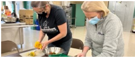
Our Paoli Team volunteered with Ann's Heart preparing over 100 free meals for the community.